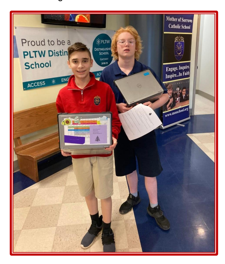
Our 8<sup>th</sup> grade students completed a Podcast project in computer class with Mrs. DeGroot.