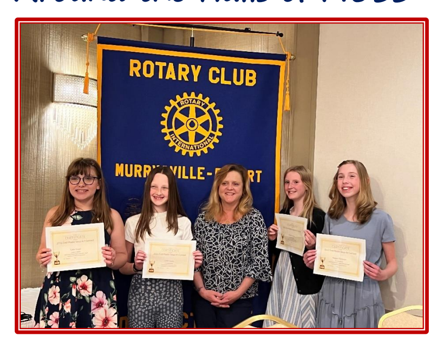
Congratulations to our winners from the Rotary Club "End Plastic Soup" contest. These students' drawings were chosen for their annual calendar.