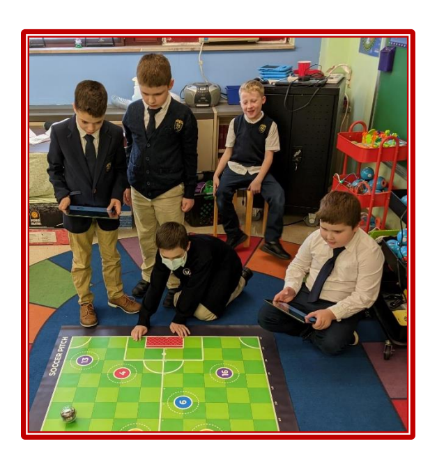
3<sup>rd</sup> grade learned all about a new robot, Sphero. They even played soccer with their new friend!