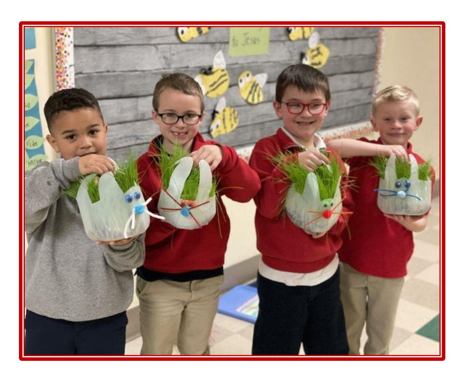
Kindergarten students grew Easter grass for baskets and also celebrated and honored Mary.