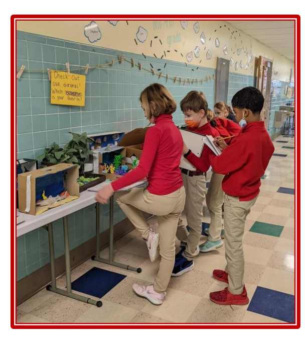
2<sup>nd</sup> grade takes a look at the beautiful display of ecosystems created by the 4<sup>th</sup> grade students.