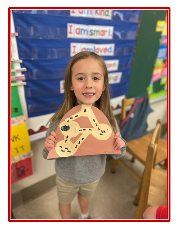
Kindergarten students learned all about ants and created an ant hill.