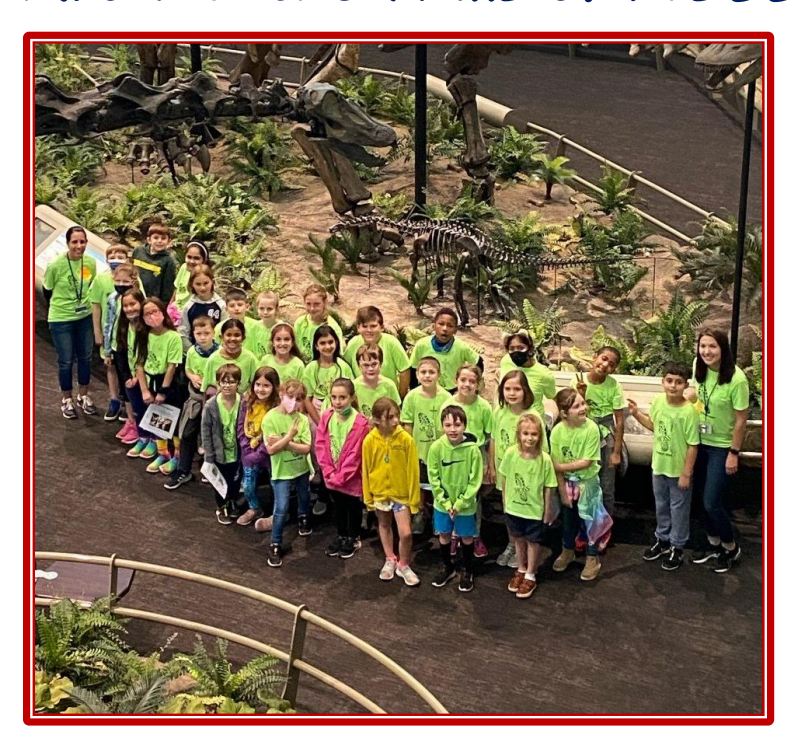
2<sup>nd</sup> grade students had an exciting day exploring the Carnegie Museum of Art and Natural History!