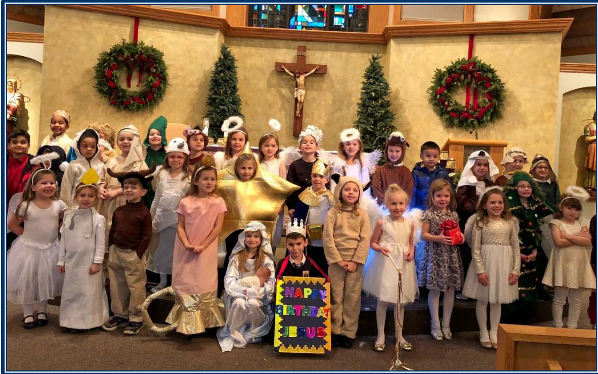
Kindergarten performed the ABC's of Advent in December. The costumes were amazing and the students did a wonderful job reminding us why we celebrate Christmas.