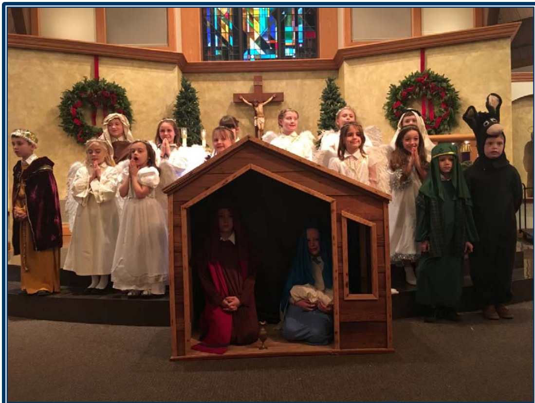
The 2nd Grade class participated in a Living Nativity Play. They did a beautiful job teaching us all about the very first Christmas!