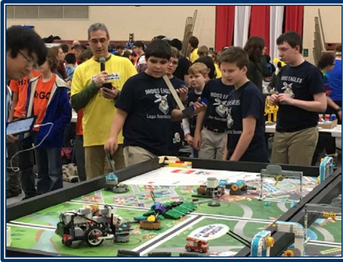
Here is a look at the Lego League Team on the competition table at the Western Pennsylvania Grand Championship.