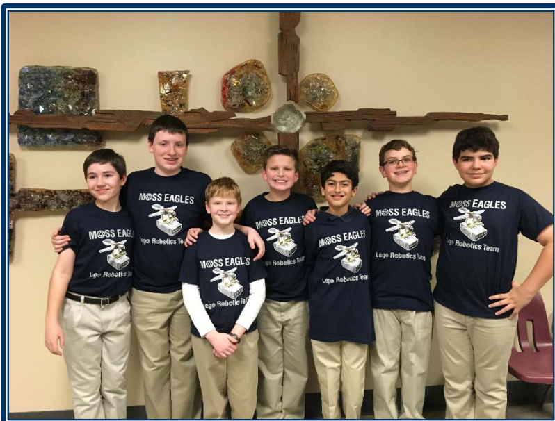
The MOSS Lego League Team: